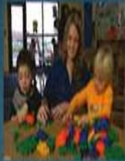
While in High School