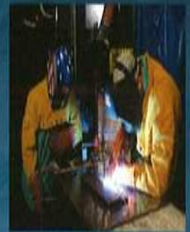
Meet Local Employers