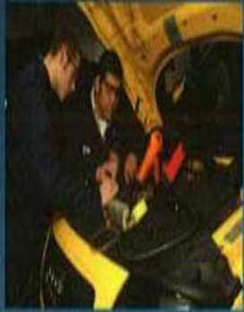
Have Fun Learning