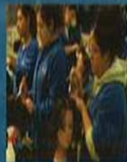
Earn College Credit