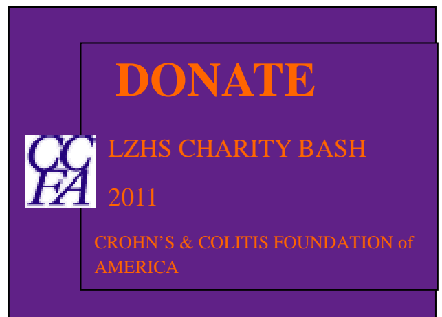
Back of the shirt